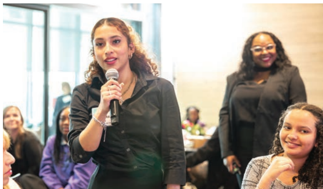
High school girls attending the Nashville Y.E.W. Forum.