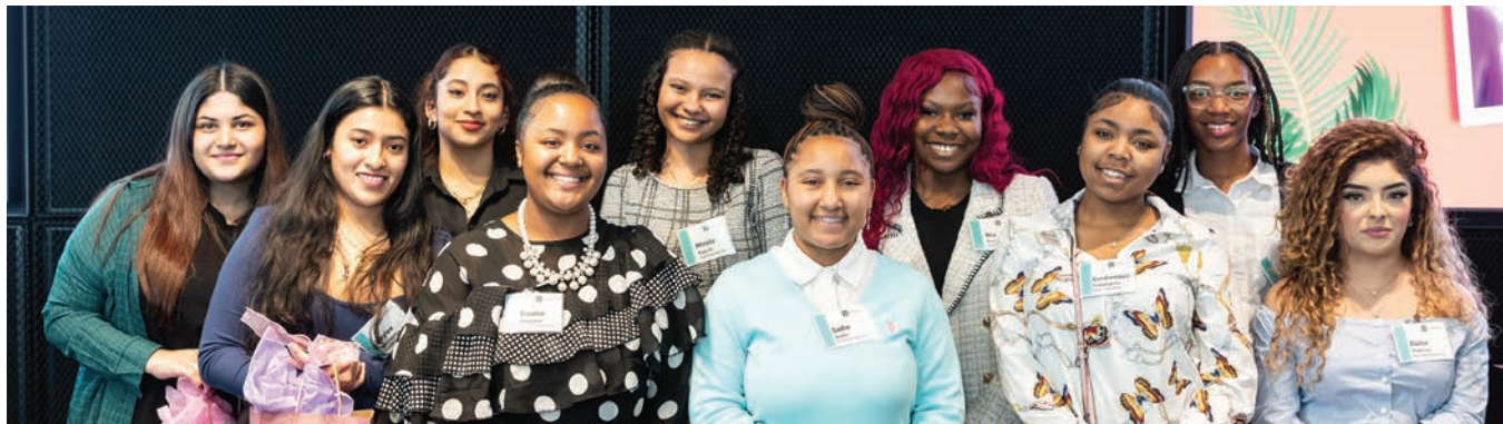
Ten Nashville Y.E.W. scholars representing Cane Ridge, Hunters Lane, Maplewood, Pearl-Cohn and Whites Creek high schools

In-kind sponsors included AllianceBernstein, Career Thrivers, Crayons & Marketers, J.P. Morgan Chase, Nashville Convention & Visitors Corporation, Skanska and Wealthy AchieveHer.